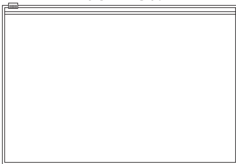
Towel - 12.5%