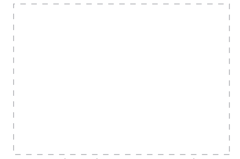
Towel - Actual Print Size: mm w x mm h

Dotted line indicates maximum print area